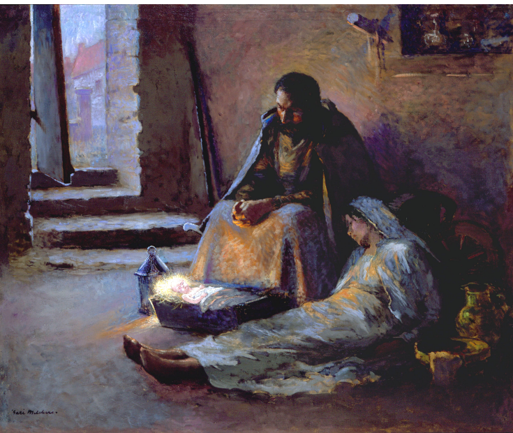
painting by Gari Melchers

Yahweh reached down into the muddy filth of David's life and lifted him free of it. More than that, He set David on a solid, unyielding rock. What a dramatic contrast to where he had been! And what a beautiful picture of the condescension of God