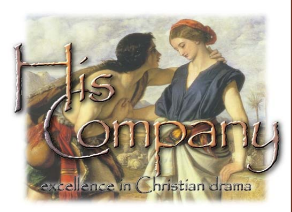
His Company logo illustration: \it Jacob\ and\ Rachel , by William Dyce Script Edition: 2004/5

We would like to hear from you when performances of this His Company script have been scheduled, so that we (and others) can be lifting you and your production up to the throne in prayer. Post as much information as you can about your production at our Support Center (http://dlampel.com/support/)—and may the Lord use this resource for His glory.