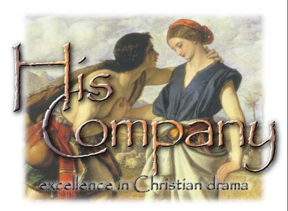
His Company logo illustration: \it Jacob\ and\ Rachel , by William Dyce Script Edition: 2004/5

We would like to hear from you when performances of this His Company script have been scheduled, so that we (and others) can be lifting you and your production up to the throne in prayer. Post as much information as you can about your production at our Support Center (http://dlampel.com/support/)—and may the Lord use this resource for His glory.