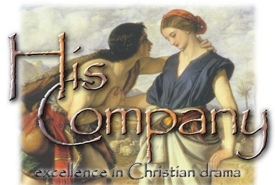
His Company logo illustration: Jacob and Rachel , by William Dyce Script Edition: 2004/5

We would like to hear from you when performances of this His Company script have been scheduled, so that we (and others) can be lifting you and your production up to the throne in prayer. Post as much information as you can about your production at our Support Center ( HTTP://DLAMPEL.COM/SUPPORT/ )—and may the Lord use this resource for His glory.